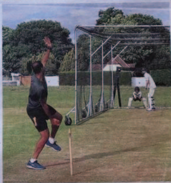
Matching Green youngsters being put through their paces by development squad head coach and former England international Owais Shah

The youngsters have been training well, despite the recent restrictions imposed by the coronavirus pandemic, and have learned several valuable lessons that should stand them in good stead for the future.