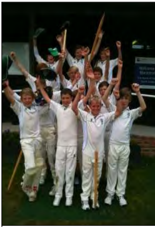
Dorset County Under 12s