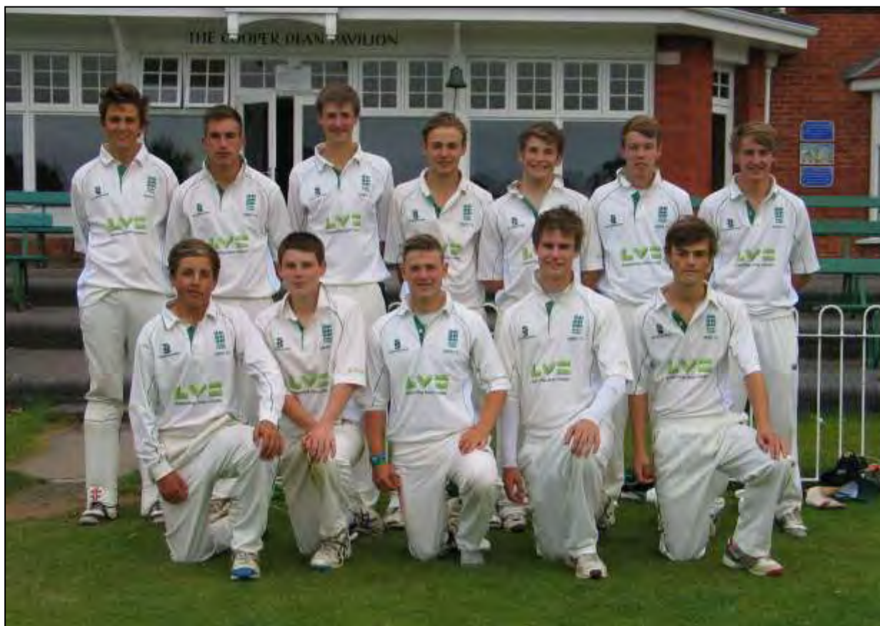
Dorset County Under 17s

Thank you all for attending and we wish you all the best for the 2013 season