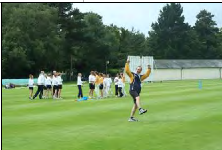
Some could not hide their feelings of ecstasy