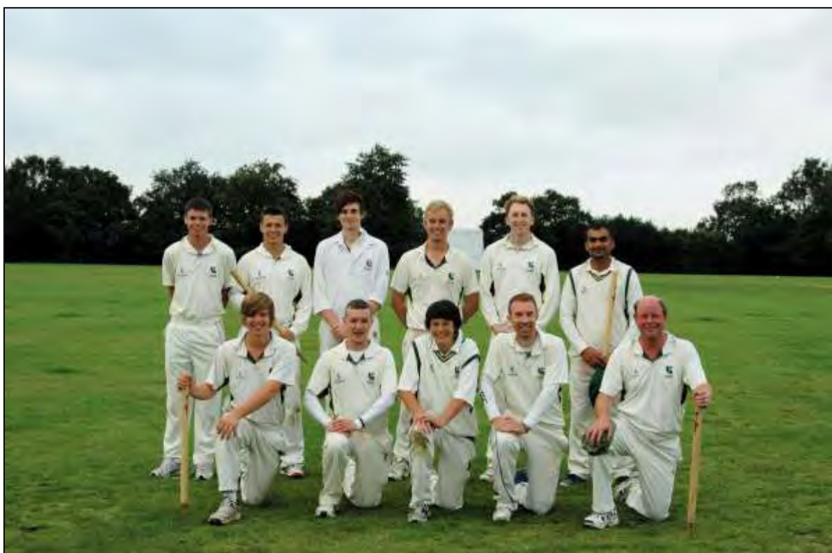
Corfe Mullen's Sunday XI – Division Two Champions