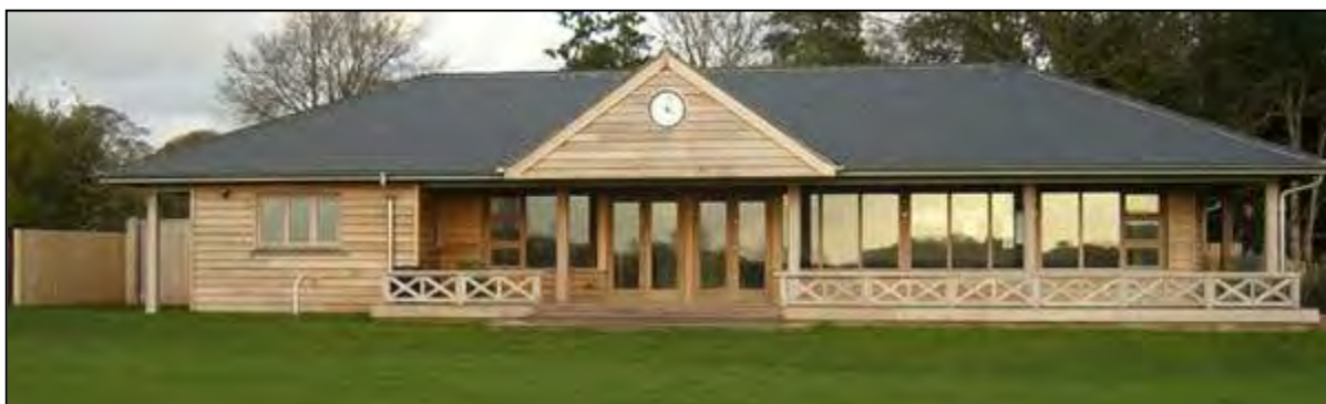
New Dorset Cricket Development Office – The Leaze, Wimborne CC