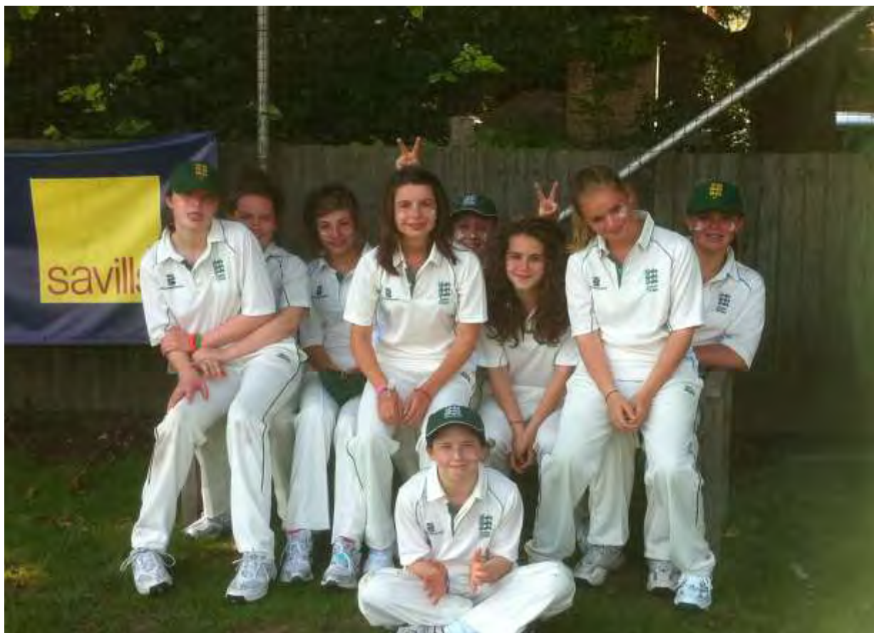
Dorset County Girls Under 13s