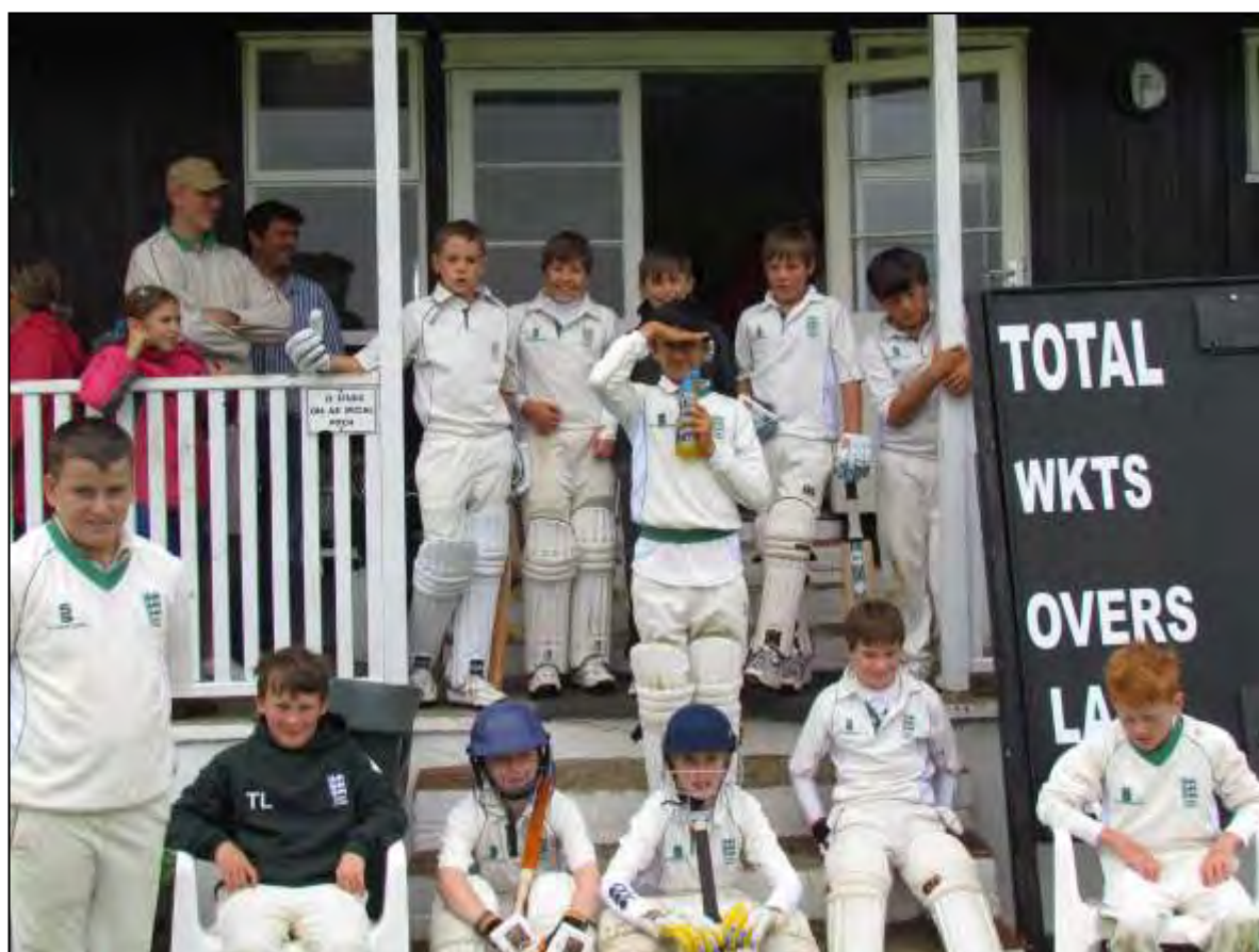
Dorset County Under 11s