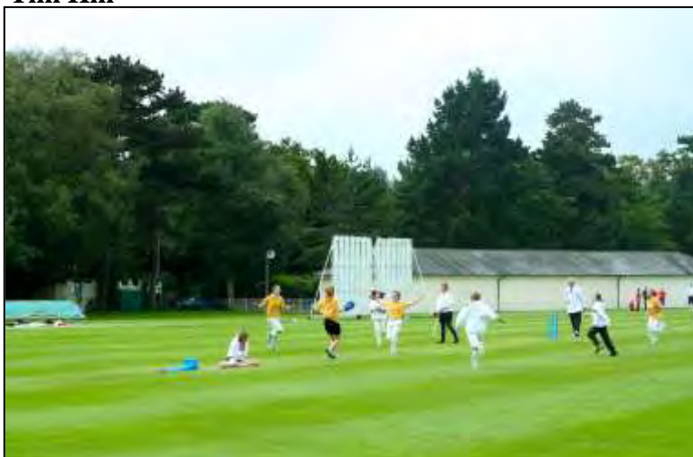
Parkstone celebrate victory in the Under 13