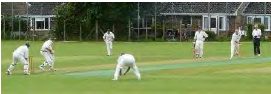
Action from the Wiltshire innings.