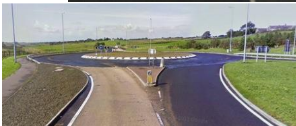
Figure 2 Only Roundabout on the course