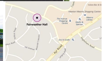
Figure 3 & 4 – Fairweather Hall (sign on) Fairweather Hall, Barrhead Road, Newton Mearns, G77 6BB