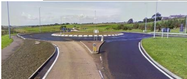
Figure 2 Only Roundabout on the course