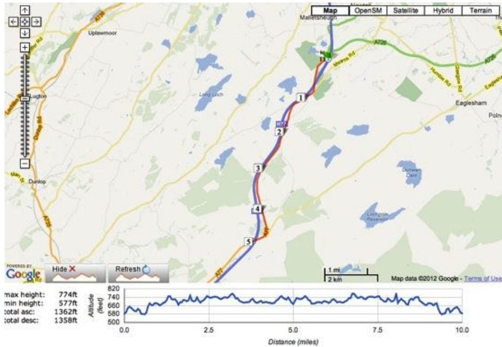
Figure 1 Below Left, Start Area, Below Right Finish Area

A video of the course can be viewed @ http://youtu.be/UvkKpl7ITo