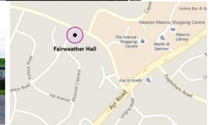
Figure 3 & 4 – Fairweather Hall (sign on) Fairweather Hall, Barrhead Road, Newton Mearns, G77 6BB