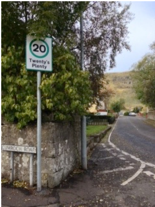
Finish Area Photo