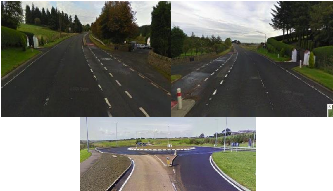
Figure 2 Only Roundabout on the course

Strava segment link - **please make sure you take note of start and finish points**