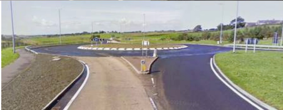
Figure 2 Only Roundabout on the course