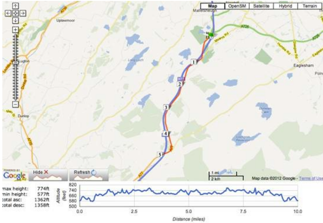
Figure 1 Below Left, Start Area, Below Right Finish Area

A video of the course can be viewed @ http://youtu.be/UvkKpl7ITo