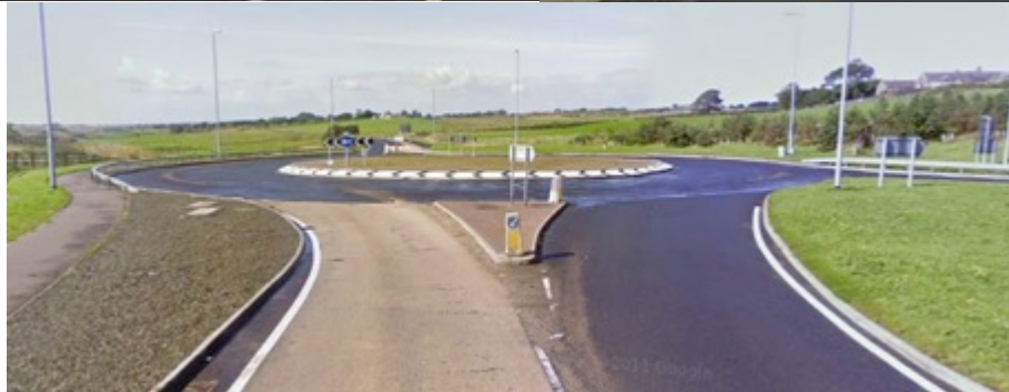
Figure 2 Only Roundabout on the course