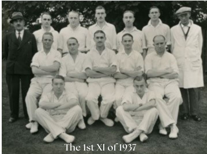
The 1st XI of 1937