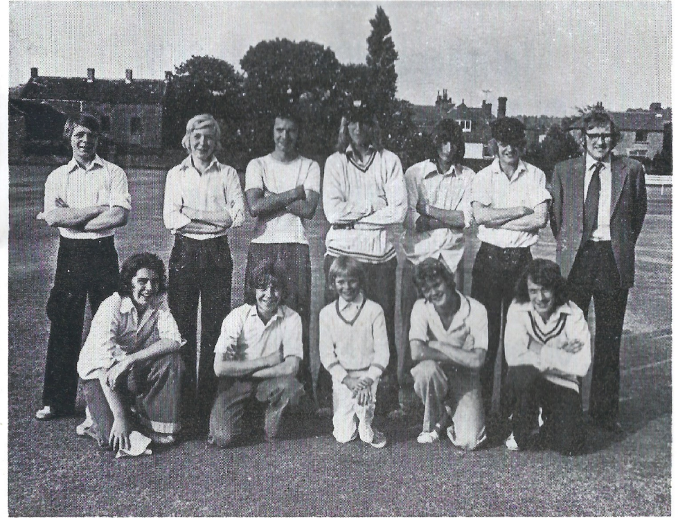
OUR PRESENT SUCCESSFUL JUNIOR TEAM

Estate Agent: Wilby's Railway Street, HUDDERSFIELD