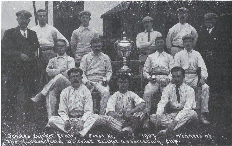
Scholes Cricket Club, First XI, 1907, winners of The Huddersfield District Cricket Association Cup.

The earliest photograph of 1907 does give us proof that Scholes had teams playing in the Association, as the Scholes 1st XI won the Huddersfield & District Cricket Association Cup and of the 2nd XI. 1907, when the team won the Lumb Cup. Incidentally to-day, this Cup is one of the oldest cricket cups in Yorkshire, and still competed for in the Association League. Other photographs will be of interest to many of the older generation, and could also be treasured in years to come by the younger generation.