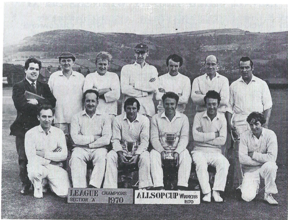
THE WINNING TEAM WITH TROPHIES