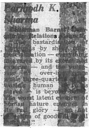
Can he say that?

The BARNET PRESS asked what do you think of Christmas