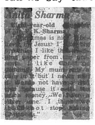
That's better.