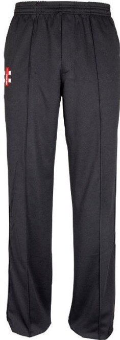
Matrix T20 Trousers (Black)

www.gray-nicholls.co.uk/collections/livingston-cc