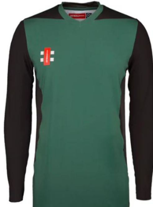
T20 Long sleeve Shirt (Green and Black)